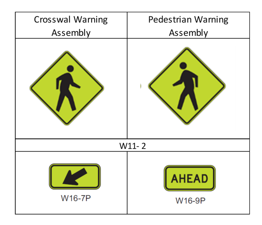
Figure 3 – Standard crosswalk signing uses both the W11-2 and W 16-7 P – Advanced assemblies use S1-1 and W 16-9 P